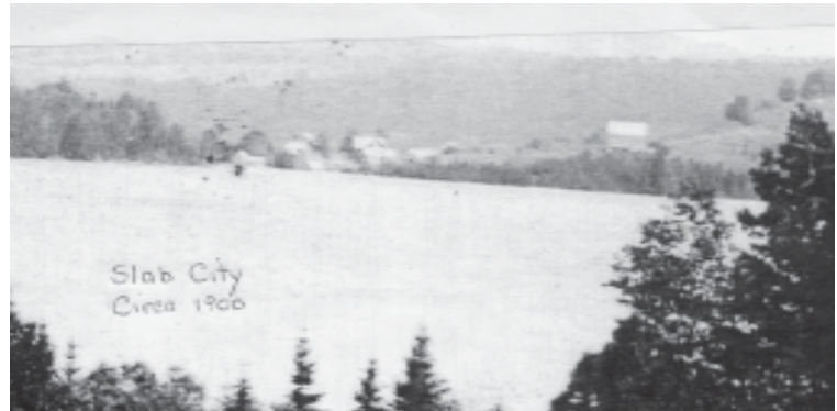
View of Slab City from Shadow Lake, 1900

Today there are more than 125 camps and homes on Shadow Lake in Glover, Vermont. The scene over 100 years ago was quite different. "Slab City" (so named because of the numerous saw mills) was an early manufacturing community located in South Glover around the outlet of Shadow Lake. Here there were not only several saw mills but a box factory, a starch factory, bobbin mill, several farms, a school, post office, and boarding houses where one could get food and libations if desired.